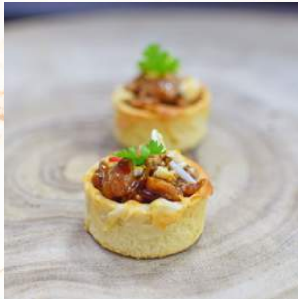
Sesame chicken wonton cup