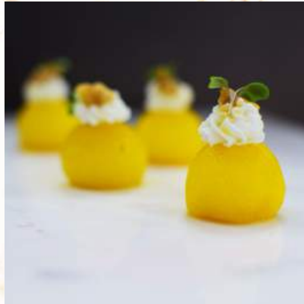
Saffron-poached pear, goat's cheese mousse, honey walnut (v)