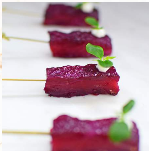
Beetroot salmon gravlax, dill crème fraiche