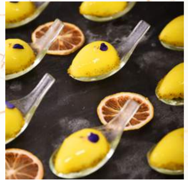
Pistachio lemon curd (mousse)