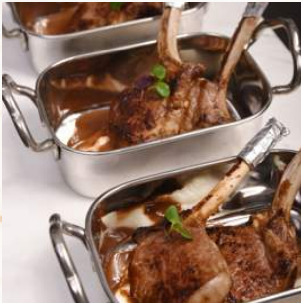
Grilled Lamb Chop, cauliflower mash, gravy