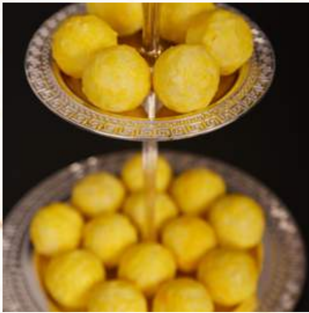
Lychee vanilla truffle