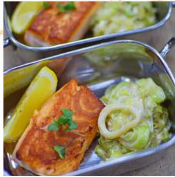
Salmon pave with leeks fondue