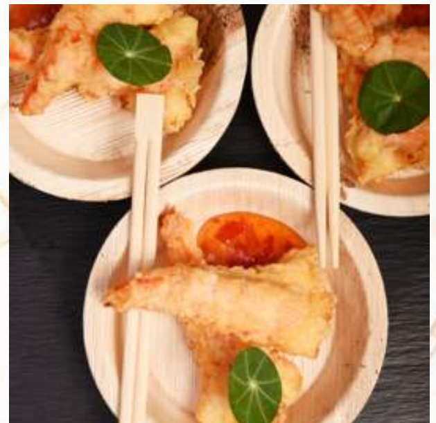
Tempura prawns, sweet chilli dip