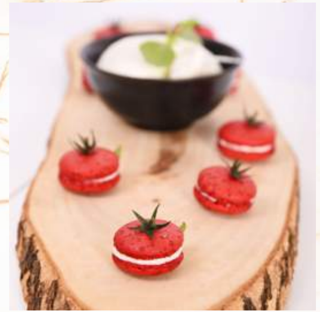
Tomato burrata macaron