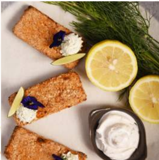
Salmon fishcakes, creamy dill sauce