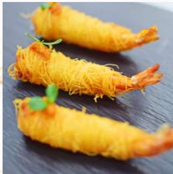
Crunchy shrimp kunafa