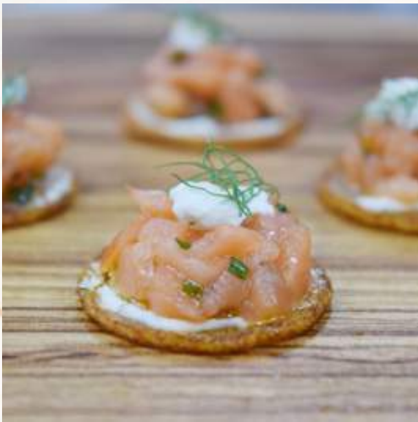
Salmon tartare, with truffle lemon dill, crispy potato chip