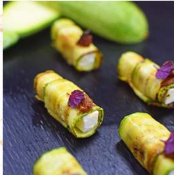
Oregano halloumi wrapped in grilled marrow (v)