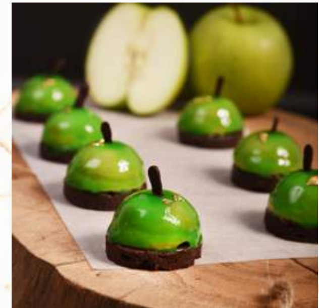
Hazelnut praline green apple (mousse), chocolate marquise