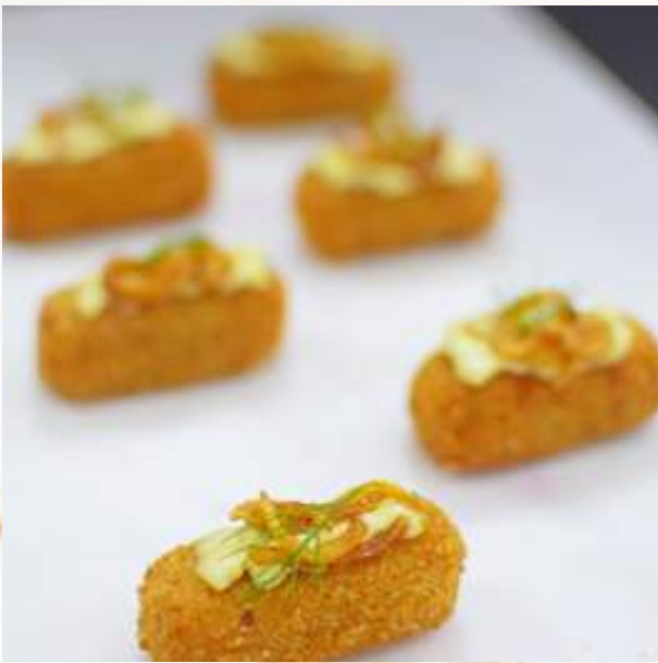
Fish & chips cromesqui