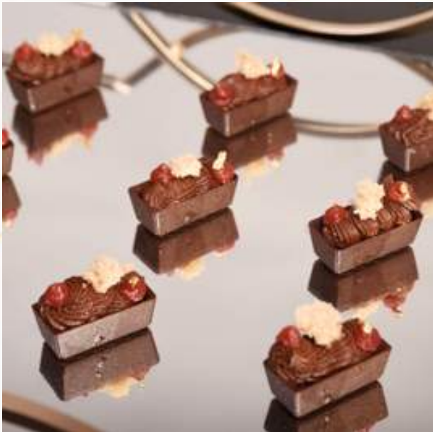
Smoked chocolate manjari raspberry tart with praline micro sponge