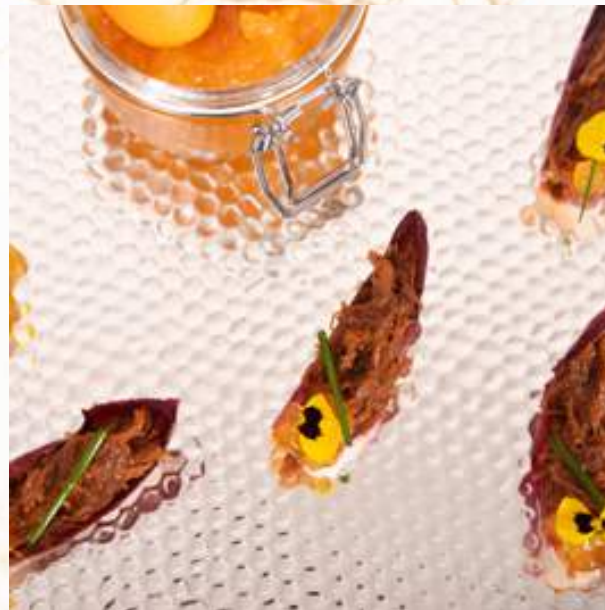
Duck effiloche on red chicory leaves with kumquat marmalade