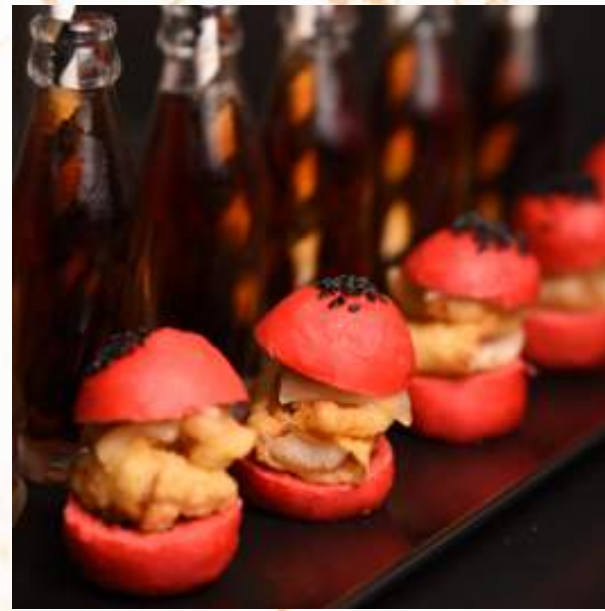
Micro calamari burger, Cheddar cheese, American sauce