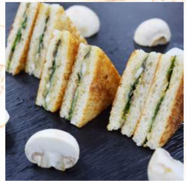
Truffle, gruyere, arugula toast (v)