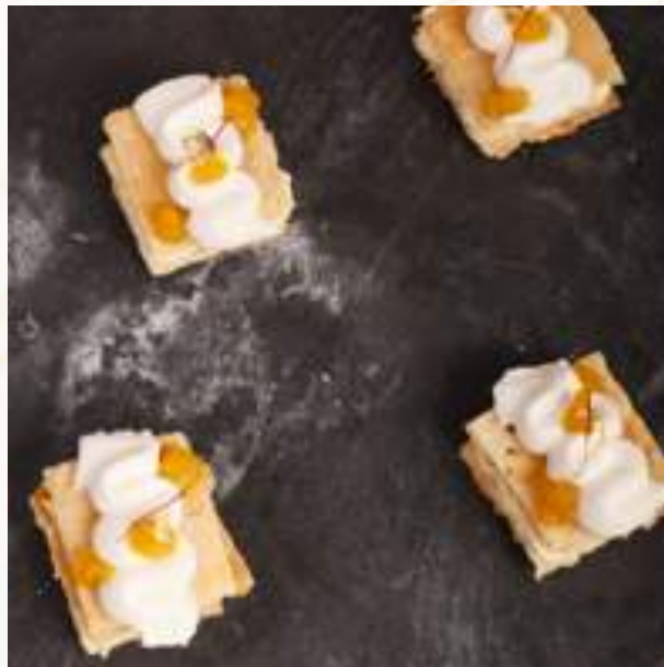
Saffron mille feuille, mango gel, coconut cream