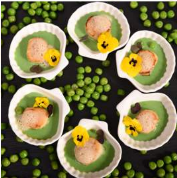
Seared scallops, pea puree shoots, cumin foam