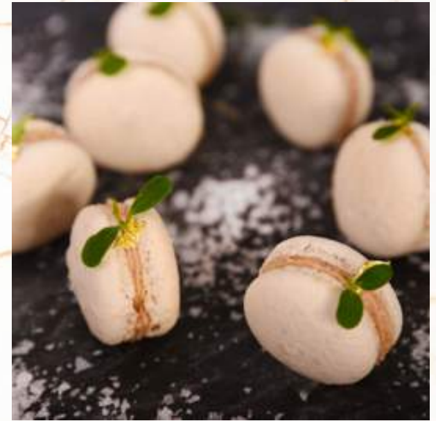
Foie gras macaron