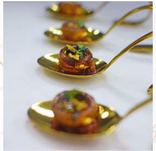
Caramelised Thai basil stuffed mushroom (vg)