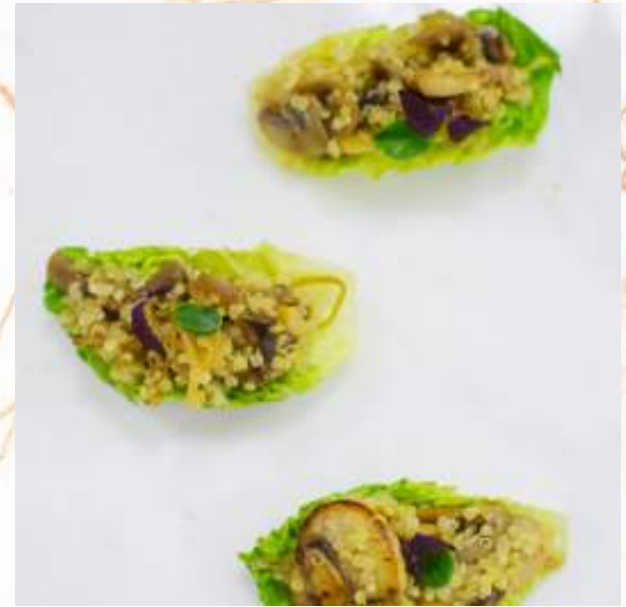
Mushroom and quinoa san choy Bau (vg)