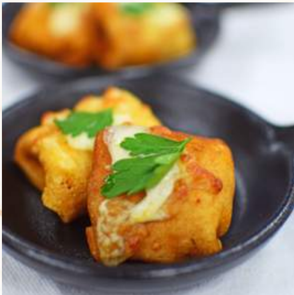
Turkish sultan kebab, béchamel sauce, kashar cheese