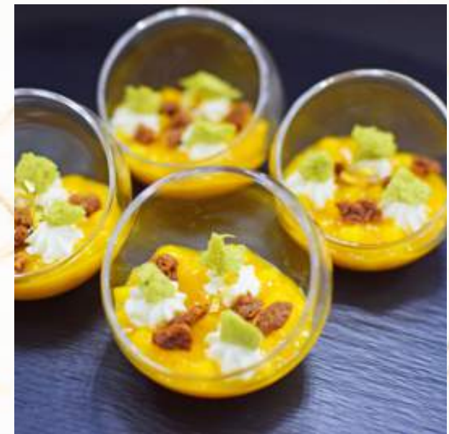
Mango apple compote with ginger cream