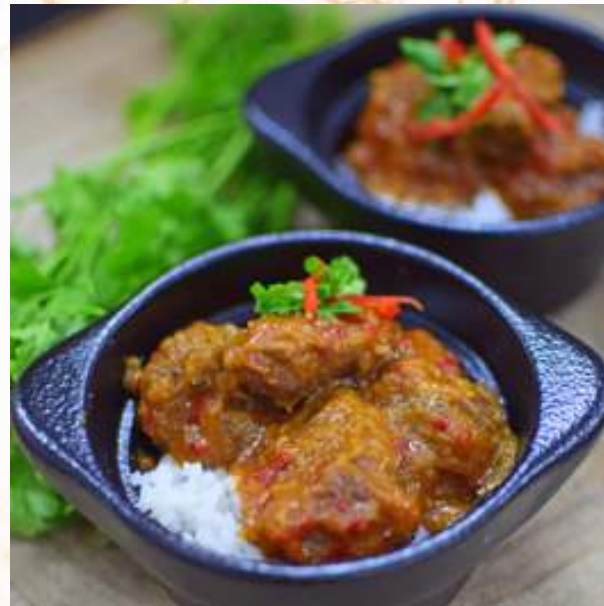
Malaysian lamb rendang, coriander and lime rice