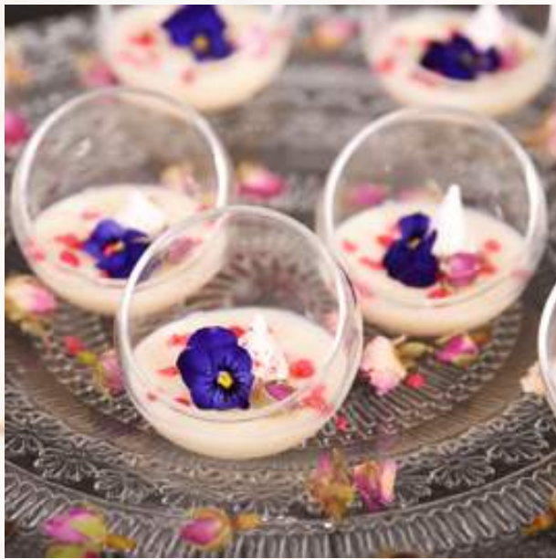
Traditional Anatolian rice pudding, raspberry, and rose ice cream (glass)