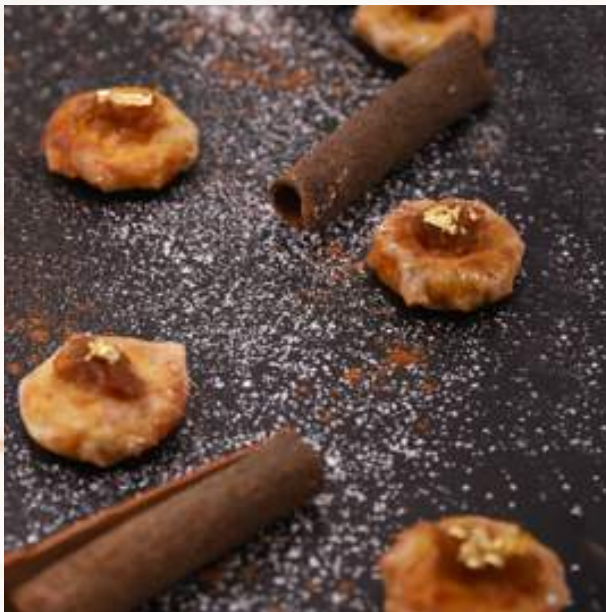
Mini chicken pastilla, cinnamon, onion chutney