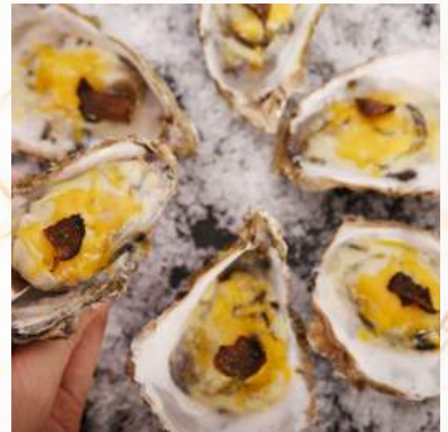
Grated oyster with truffle, mornay sauce