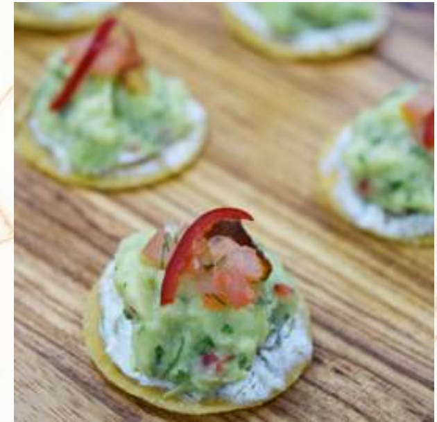
Smashed avocado smoked tomato salsa horseradish creme fraiche corn tortilla chip(v)