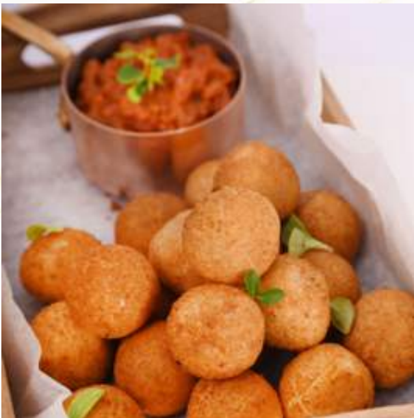
Potato camembert cheese croquette, spicy chermoula sauce (v)