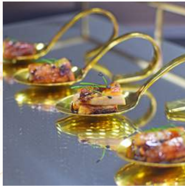
5-spice honey boneless chicken wing