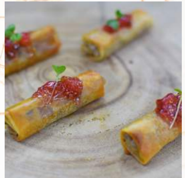
Duck confit cigar, figs chutney