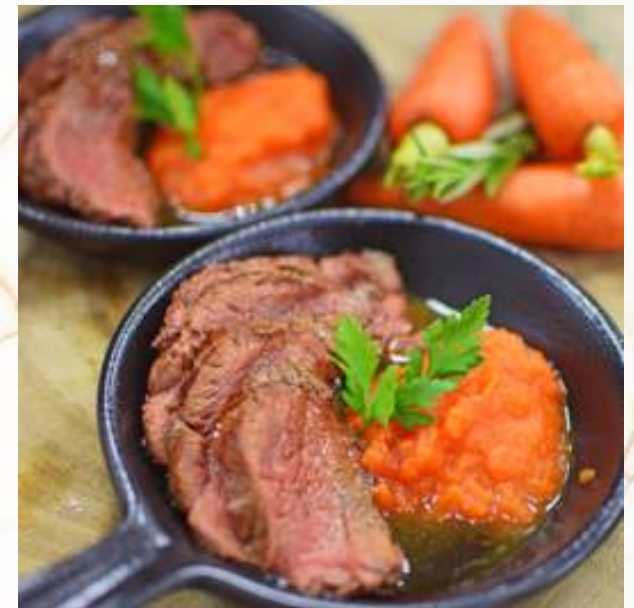
Beef medallion with carrot vanilla puree