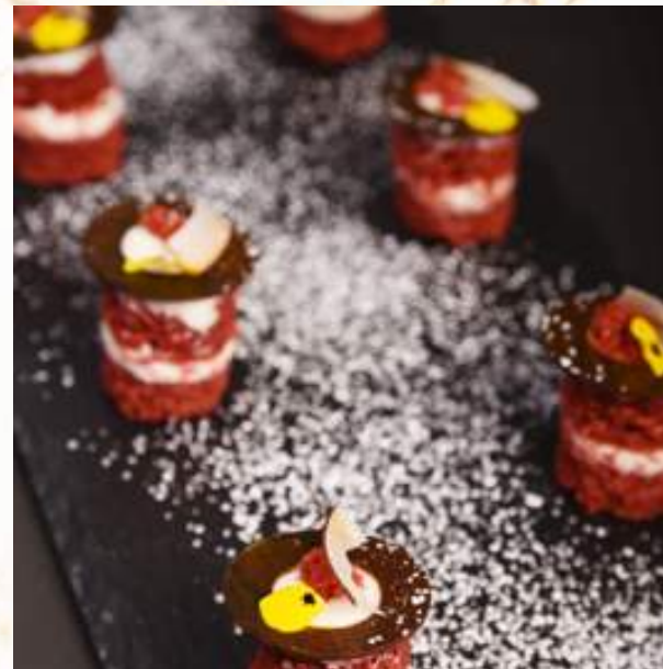
Red velvet cake, coconut cream cheese frosting