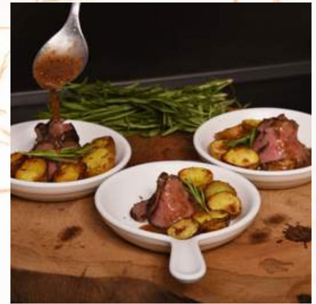
Sliced roast beef with whole grain mustard and horseradish, rosemary baby potatoes