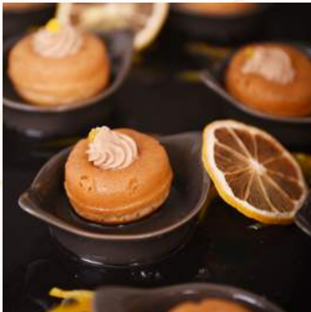
Caramelized orange baba with orange chip, caramel mousse