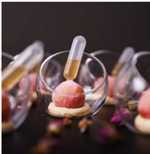
Honey and rose cream, rolled mini doughnut