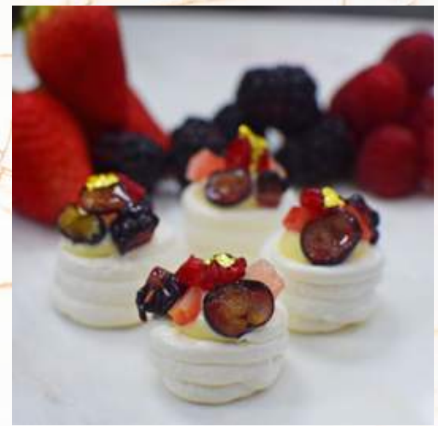
Mini meringue with vanilla cream berries