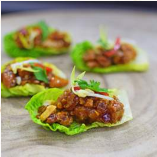
Chicken san choy Bau