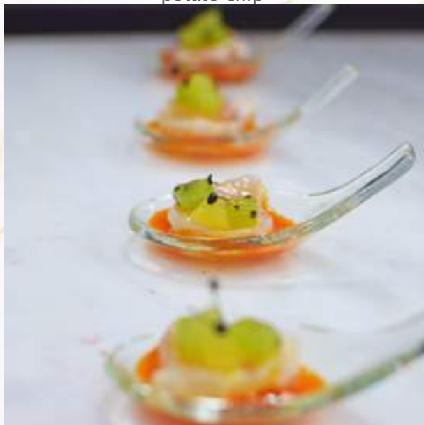
Prawn ceviche, fennel, red pepper puree, kiwi