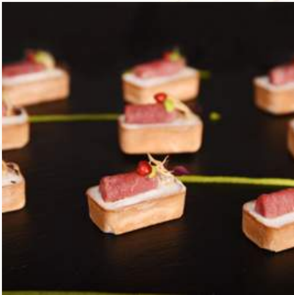
Roasted beef, wasabi, celeriac en croute