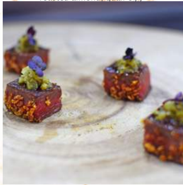
Smoked wagyu beef with ravigot