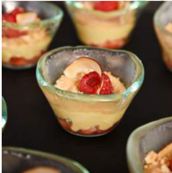
Dulce de leche strawberry with coconut dacquoise