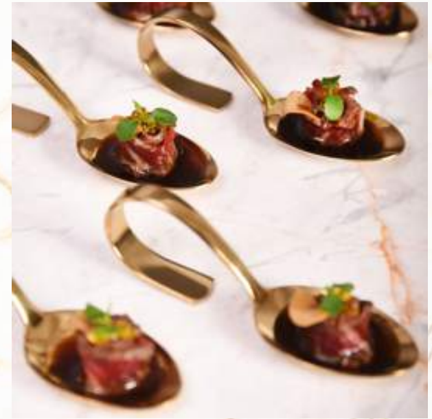
Wagyu tataki caviar, garlic chips, sesame oil