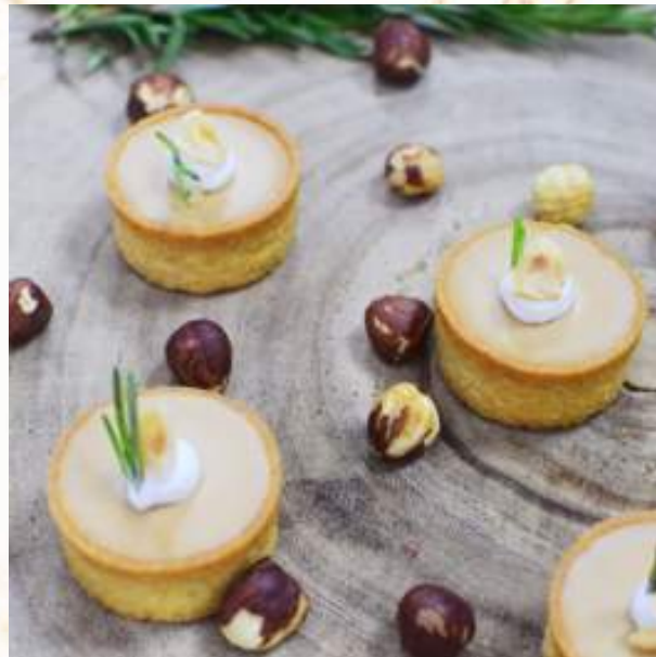
Dulce de leche rosemary tart