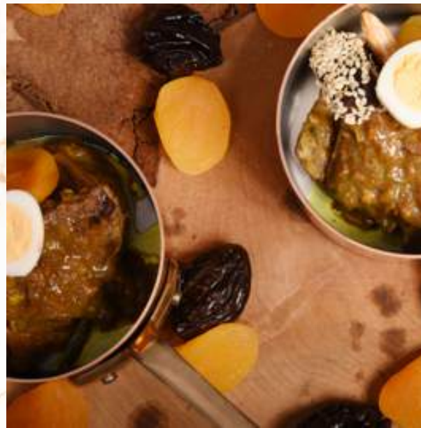
Lamb tagine, prunes chutney, roasted almonds, baguette slice