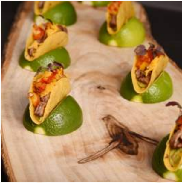
Mini pulled beef tacos, sautéed red capsicum, cheddar cheese