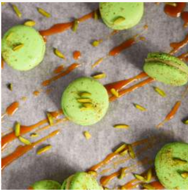
Crushed pistachio macaron