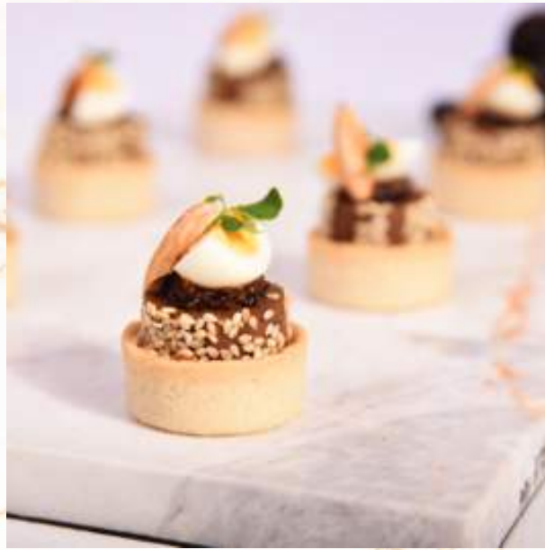
Lamb tagine tartlette, prunes chutney, roasted almond, quail egg