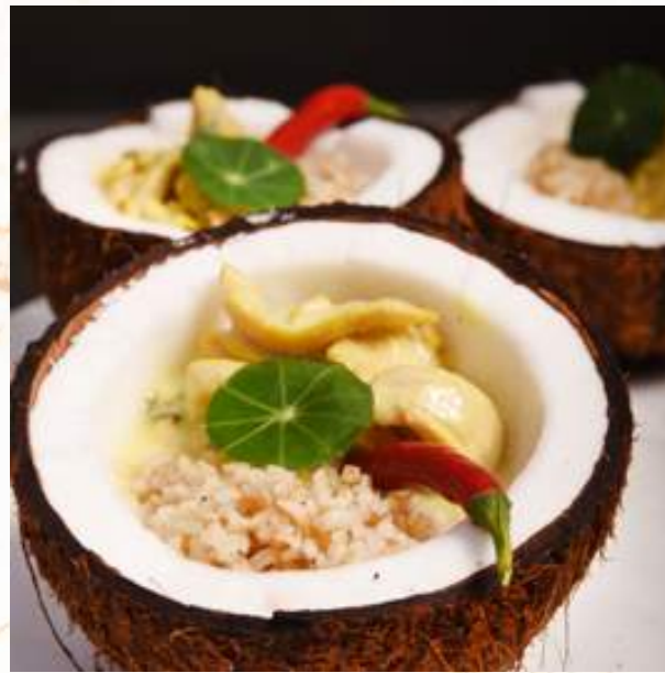
Creamy chicken, coconut and sage sauce, brown rice