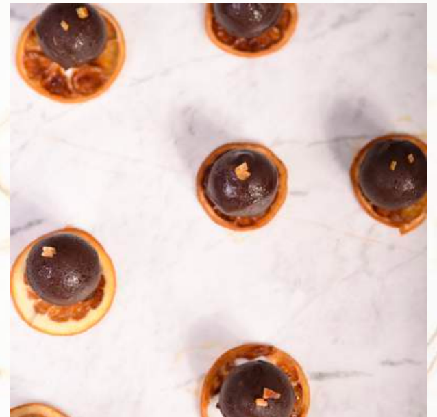
Orange blossom truffle