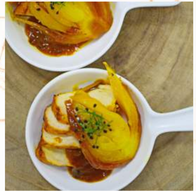
Braised chicken with orange, fennel and star anis