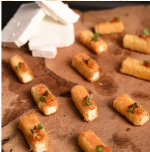
Feta in katafi pastry with apple chutney, chilli harissa (v)