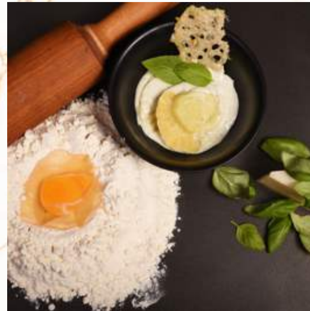
Homemade ricotta and parmesan ravioli, parmesan chips, cheese sauce, basil (v)