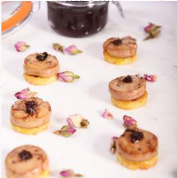
Seared foie gras, lingonberry jam on brioche