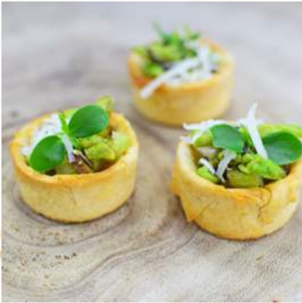
Asparagus confit with balsamic reduction (v)