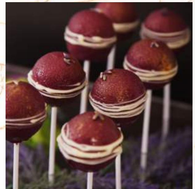
Lavender cheesecake white chocolate lollipop