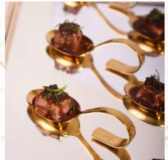
Slow cooked duck breast, plum sauce, spring onions