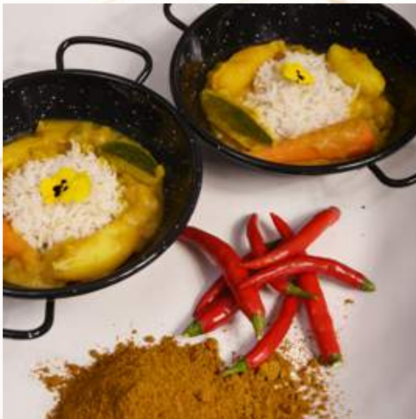
Indian yellow vegetable & pumpkin curry, basmati rice (v)