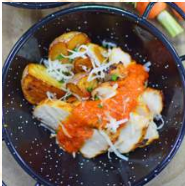
Peri peri chicken with potato wedges