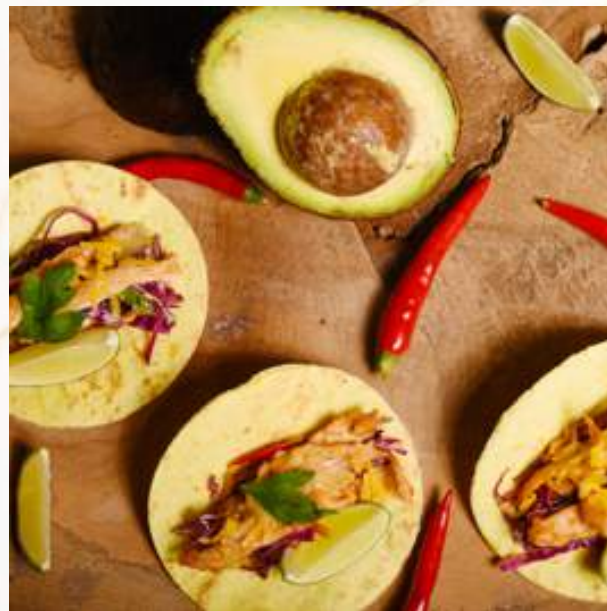
Crispy shredded chicken tacos, Mexican dressing, cheddar cheese, red cabbage