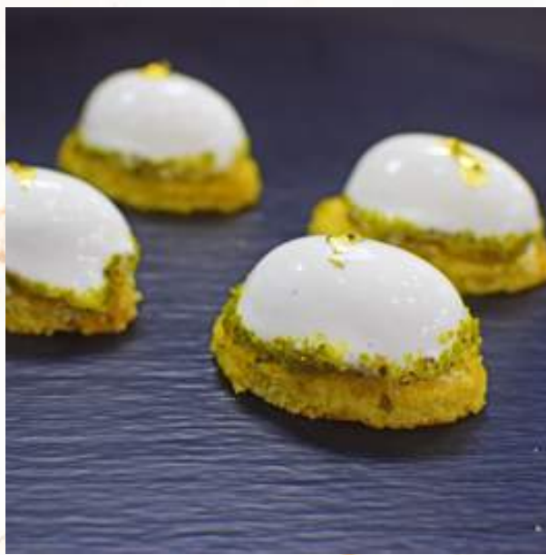
Vanilla mousse with apricot compote