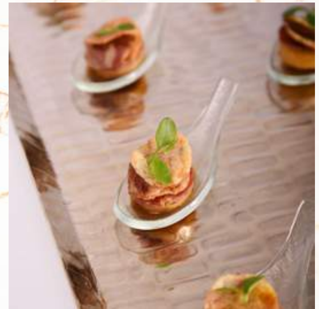
Potato beef bacon mille-feuille, beef jus